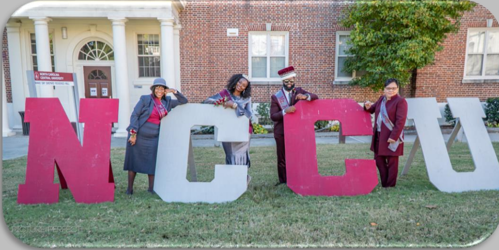
2018 NCCU Alumni Royal