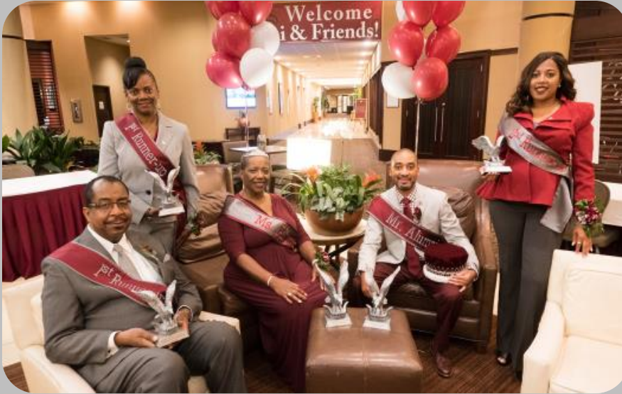
2017 NCCU Alumni Royal Court